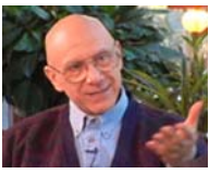
Bernie Siegel, MD